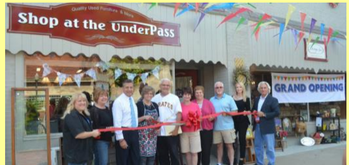
Ribbon Cutting at the Shop at the Underpass