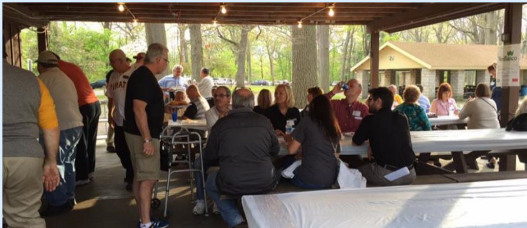
ECACC Thank You Picnic in Ewing Park