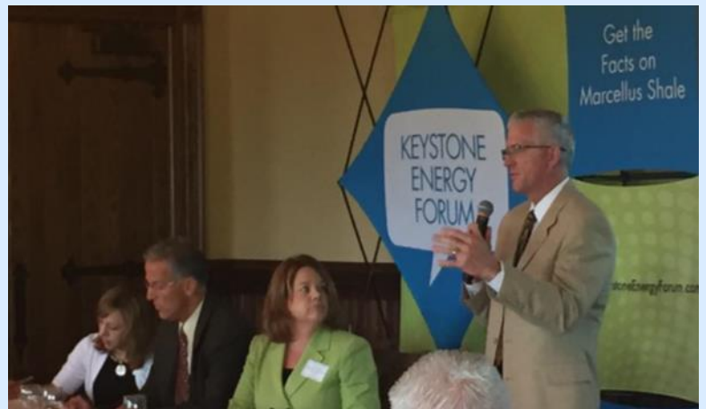
Keystone Energy Forum at Shakespeare's