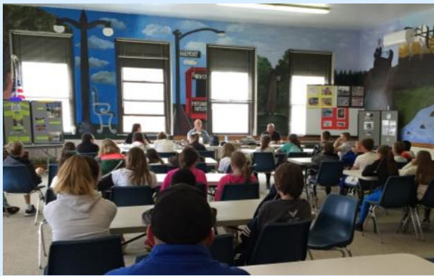
5th Grade Walking Tour