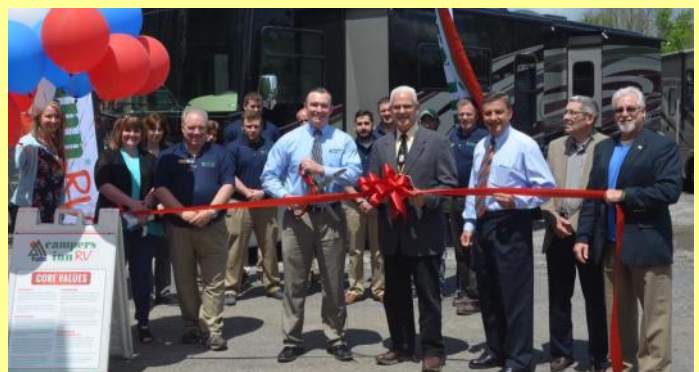
Ribbon Cutting at Campers Inn & RV