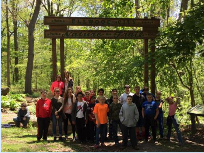
6th Grade Park-a-Palooza