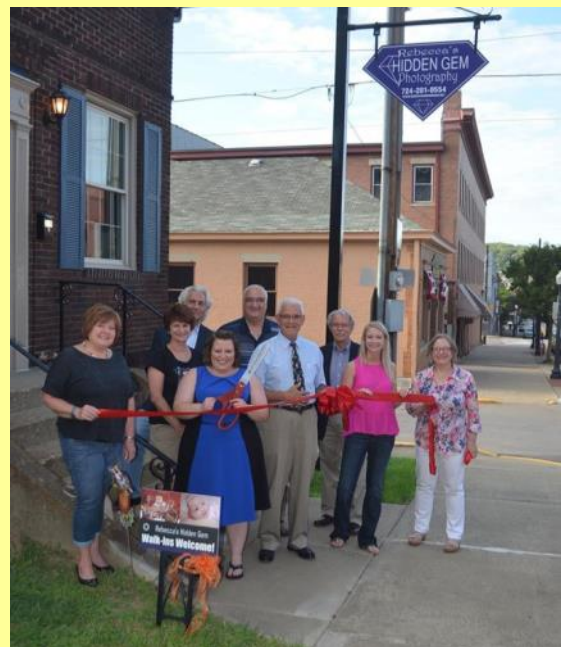
Grand Opening at Rebecca's Hidden Gem Photography Studio